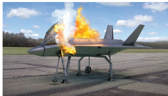
Fighter Jet Prop