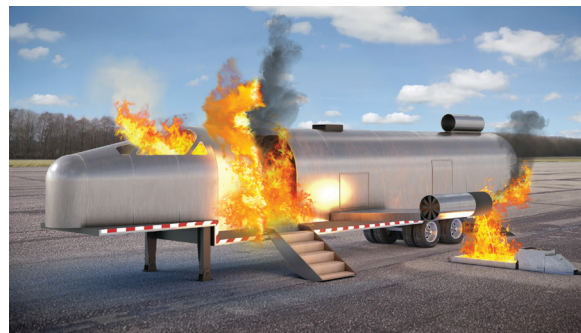
Mobile Aircraft Fire Trainer