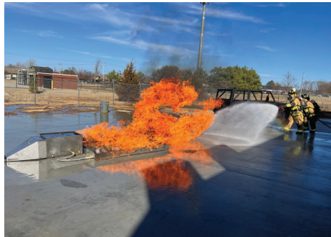
Flammable Liquids Fire Training

Symtech's multi-stage flame control ensures varied scenarios and maximum realism with progression from vapor to liquid fires in one touch. Fires include pilot confirmation for NFPA compliance and the safest training possible.