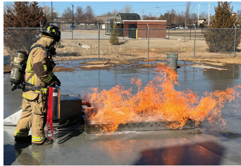
Fire Extinguisher Training