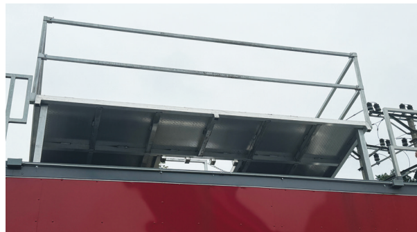
Pitched Roof Ventilation Prop