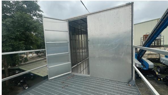
Collapsible Second Story Room